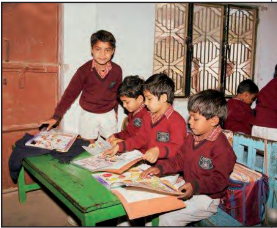
Classroom in India