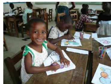
The Children's Art Village ("CAV") is based in California. CAV helps children using art in orphanages throughout the world.