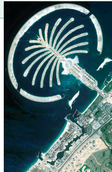
Part of Dubai from the air.