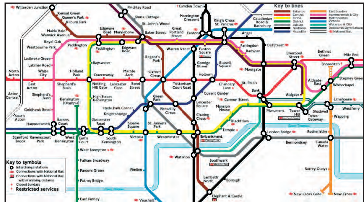
London Tube Map