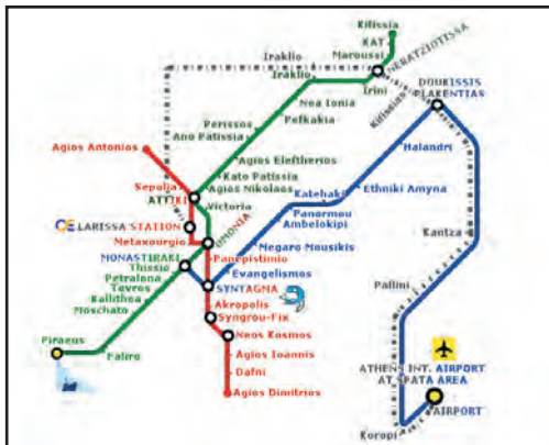
Athens Metro Map